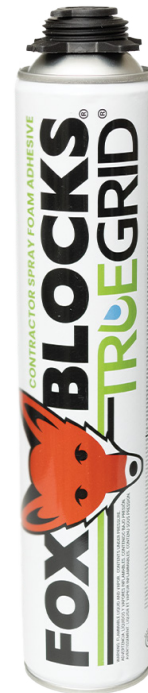
24 oz. Can

Test the Spray Foam to understand the low expansion rate, too much foam expansion may cause movement of the blocks.